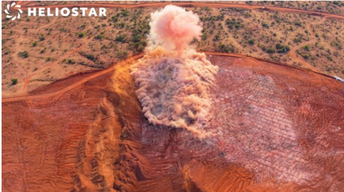
Figure 2: First blast of the Corner Area at San Agustin.

To view an enhanced version of this graphic, please visit: https://images.newsfilecorp.com/files/7729/278432_964ab61f64952905_004full.jpg