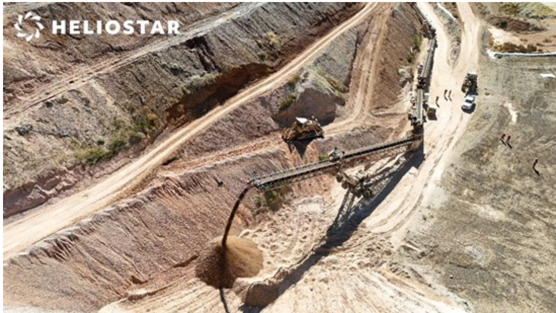
Figure 4: First new ore being conveyed and stacked on the San Agustin leach pad.

To view an enhanced version of this graphic, please visit: