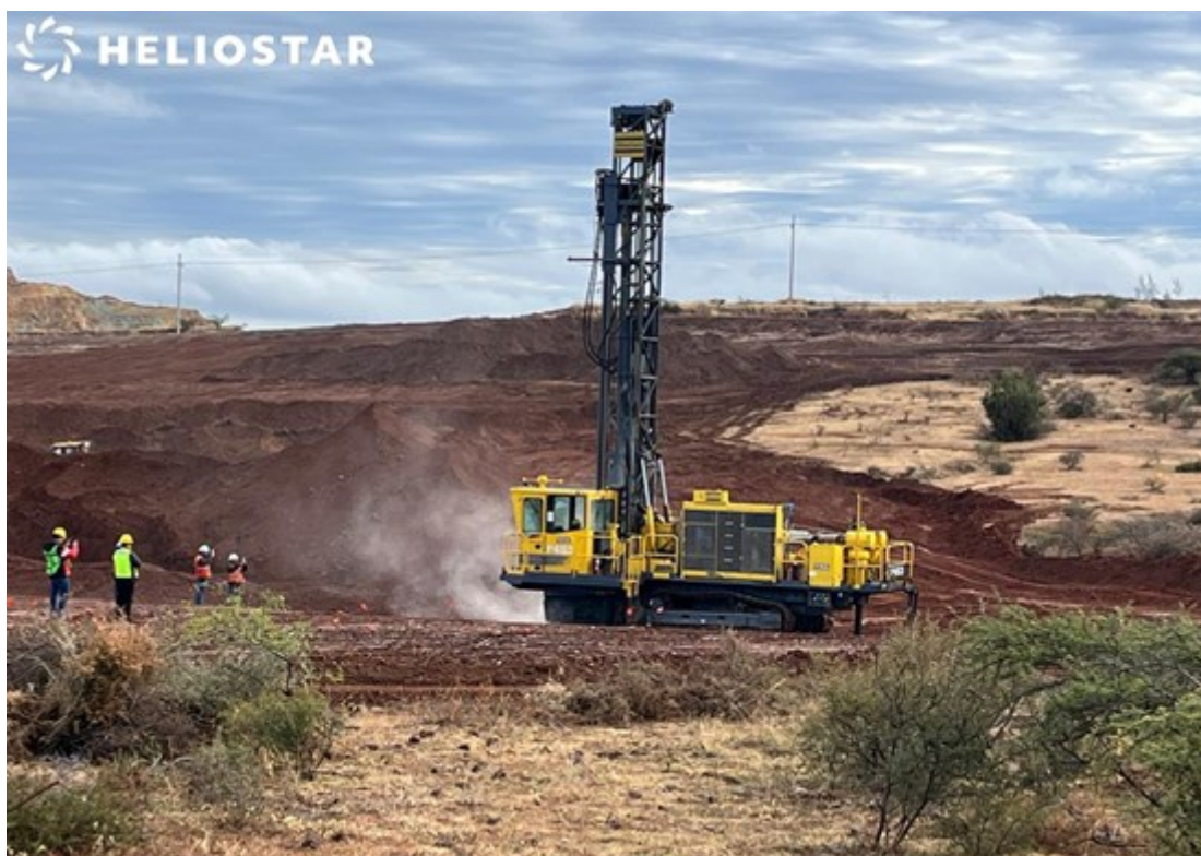
Figure 1: Production drill rig drilling blast hole patten in Corner Area at San Agustin.

To view an enhanced version of this graphic, please visit: