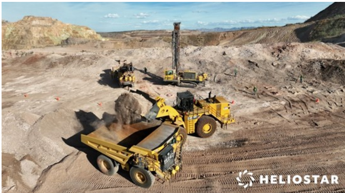
Figure 3: First ore being loaded to be delivered to the crusher at San Agustin.

To view an enhanced version of this graphic, please visit: https://images.newsfilecorp.com/files/7729/278432_964ab61f64952905_004full.jpg